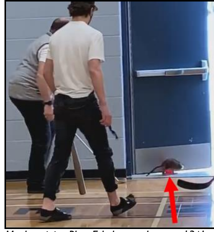
Muskrat joins Phys Ed class on January 13th!